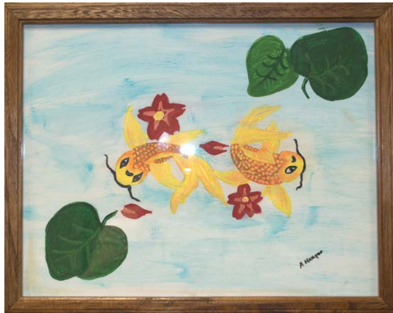
By: Amy H. Lapeer County

NOTE: If your benefits are continued because you used this process, you may be required to repay the cost of any services that you received while your appeal was pending if the final resolution upholds the denial of your request for coverage or payment of a service. State policy will determine if you will be required to repay the cost of any continued benefits.