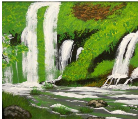
By: Vern F. Sanilac County

If you are being treated in a hospital, halfway house, or other live-in setting as part of your treatment for substance use disorder, you have some additional rights, such as the right to keep your own money and the right to know the rules about having visitors. These rights are included in the “Know Your Rights” brochure in your Welcome Packet.