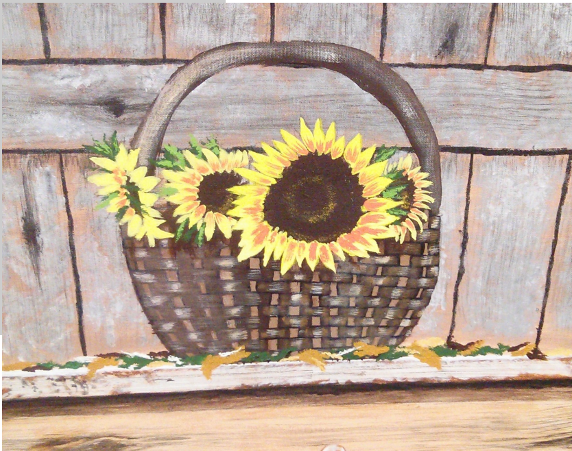
Sanilac County

Providing public services for mental health and substance use disorders through the Community Mental Health agencies in Genesee, Lapeer, Sanilac and St. Clair Counties and a panel of other care providers.