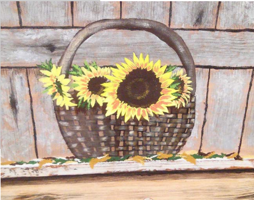
Sanilac County

Providing public services for mental health and substance use disorders through the Community Mental Health agencies in Genesee, Lapeer, Sanilac and St. Clair Counties and a panel of other care providers.