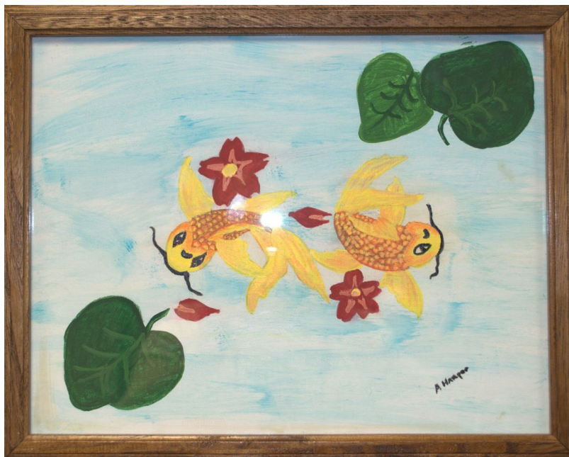
By: Amy H. Lapeer County

NOTE: If your benefits are continued because you used this process, you may be required to repay the cost of any service(s) that you received while your appeal was pending if the final resolution upholds the denial of your request for coverage or payment of a service. State policy will determine if you will be required to repay the cost of any continued benefits.